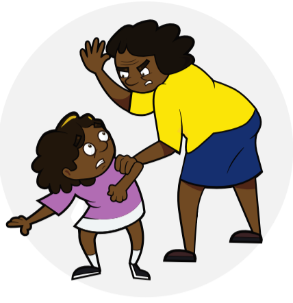
Hitting or hurting a child's body