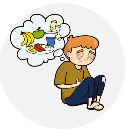
Not providing enough food, clothing or medical needs for a child