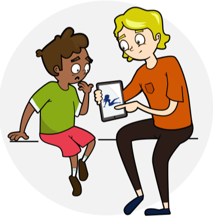
Showing pornography to a child