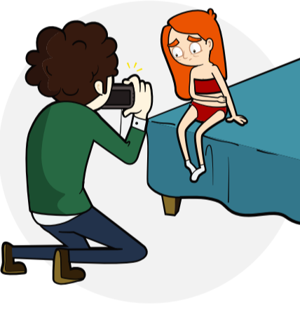
Taking sexual photos or videos of a child