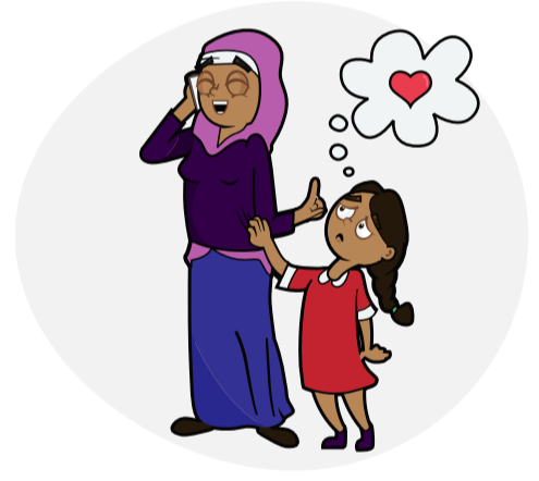
Not showing a child love and attention