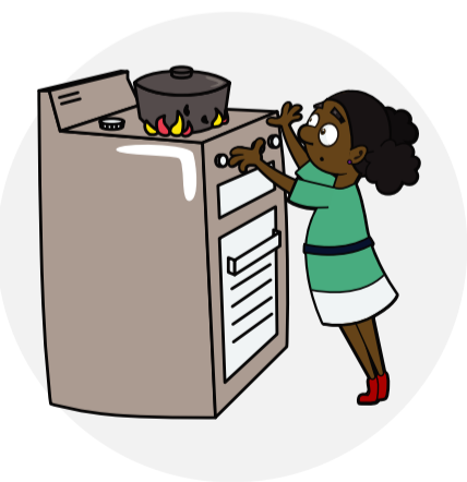
Leaving a child without adult care