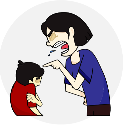
Yelling at or threatening a child