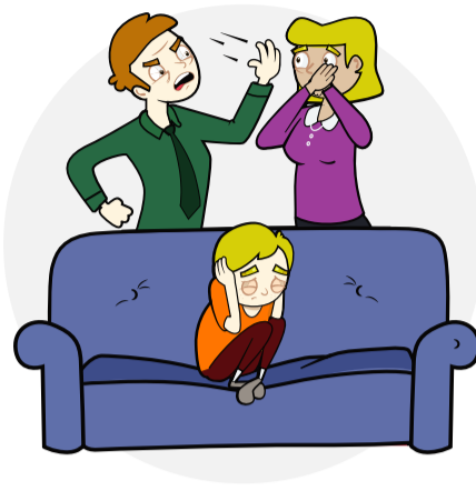
Exposing a child to violence