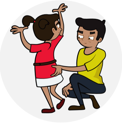
Touching a child's private parts