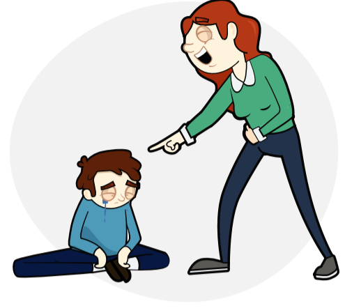
Teasing or being mean to a child