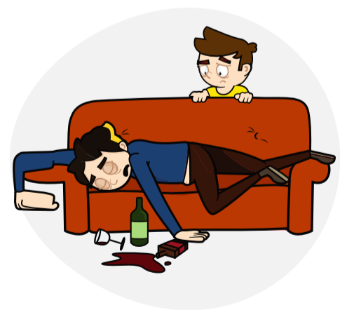
Being intoxicated in front of a child